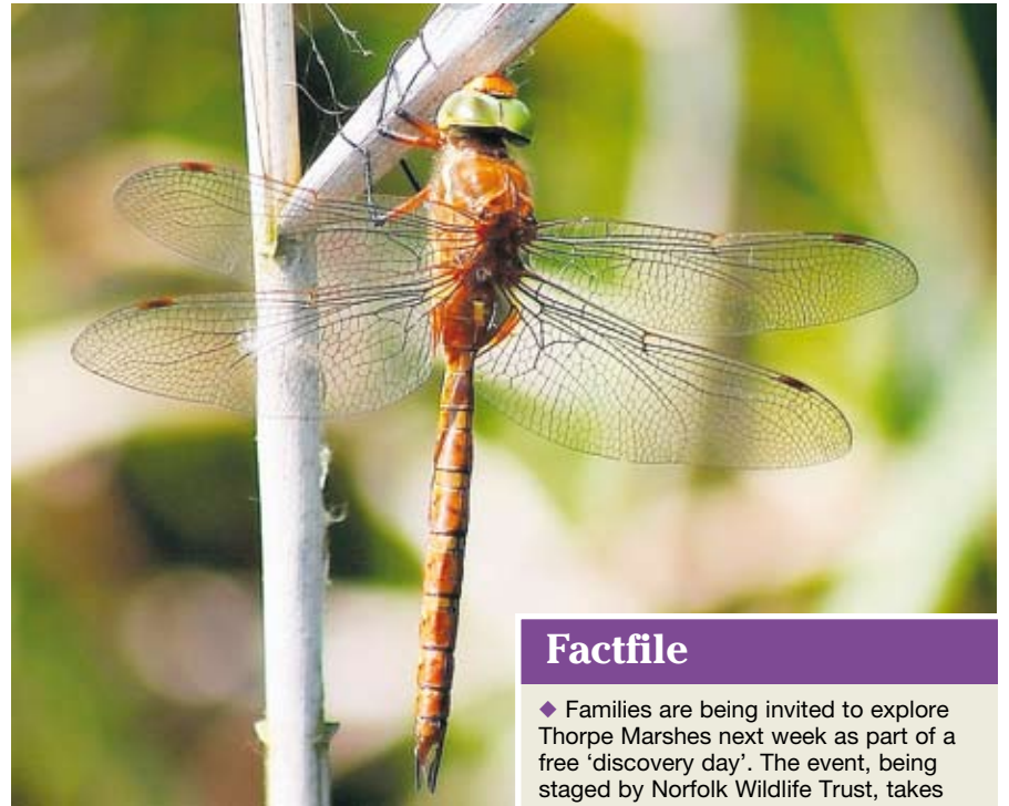
Wildlife to watch: Norfolk Hawker.