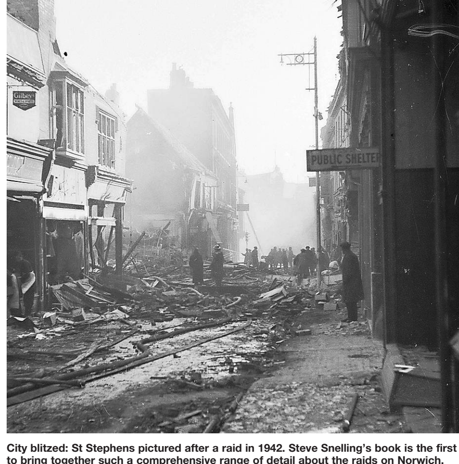
to bring together such a comprehensive range of detail about the raids on Norwich.

acted as fire watchers who braved bombs to put out incendiaries and rescue people. Some of the most vivid photos were taken by George Swain, a local photographer. Snelling doesn't avoid mentioning cases